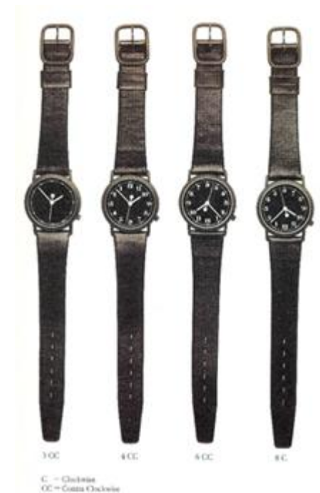
Photo: On all watches the time is 8 minutes past 10

C = Clockwise, CC = Counterclockwise. Notice: these dials with hour + minute + second indicators (hands) all read the time at exactly: 10 hrs 11 minutes and 28 seconds (10: 11.28)